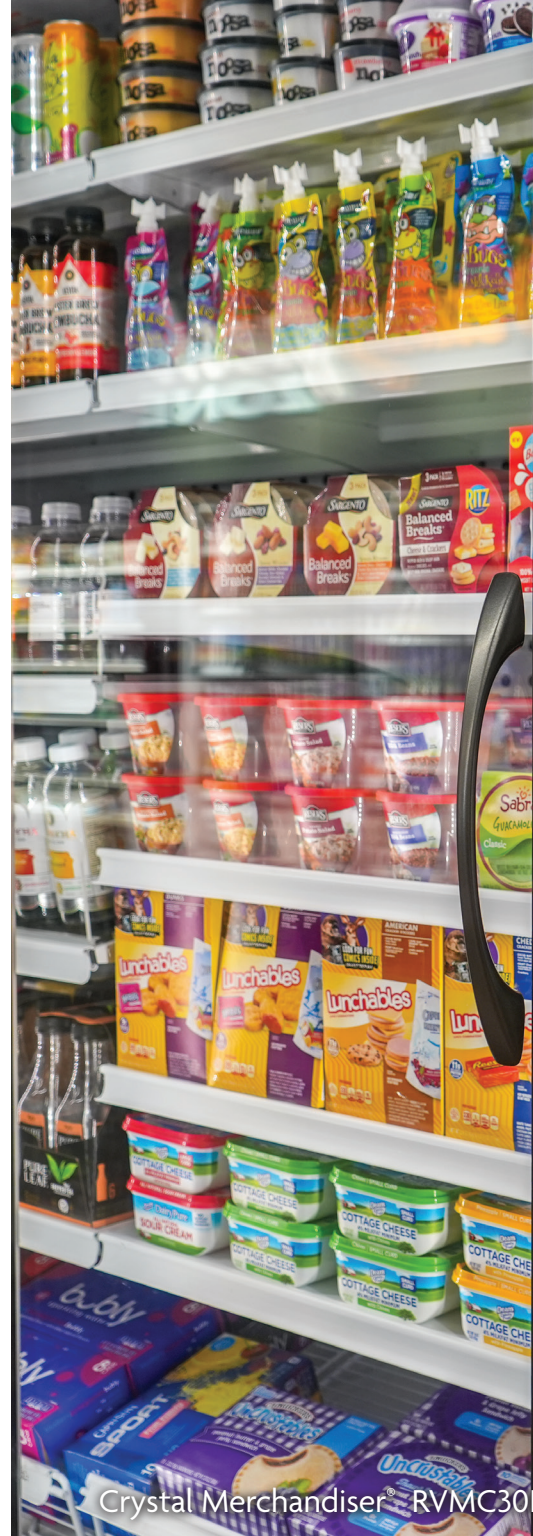
Crystal Merchandiser® RVMC30BC

A convenience store typically requires compact, energy-efficient refrigeration systems and display cases that maximize product visibility and accessibility while fitting within limited floor space.