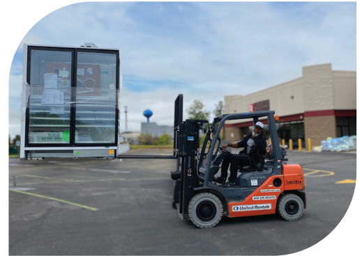
Case forkliftable for install

“Over time does it take three days to get it fixed or 12? Each day is a multiplier, and I would say Zero Zone is leading the class by at least 10%.”