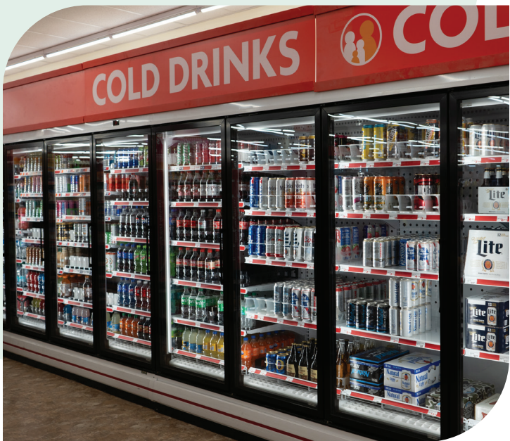
Highlight Merchandiser® Lineup - Burlington, WI.

Dollar Tree operates over 16,000 retail locations across the United States and Canada. Efficient refrigeration is critical to their operations, enabling the sale of perishable goods while maintaining cost efficiency. Zero Zone, a trusted partner since the early days of the chain, has played a pivotal role in ensuring refrigeration systems meet the rigorous demands of the business. As a publicly traded company, the chain is under constant pressure to meet performance goals, uphold transparency, and deliver quarterly results, requiring reliable partners like Zero Zone to ensure seamless operations and minimize risks.