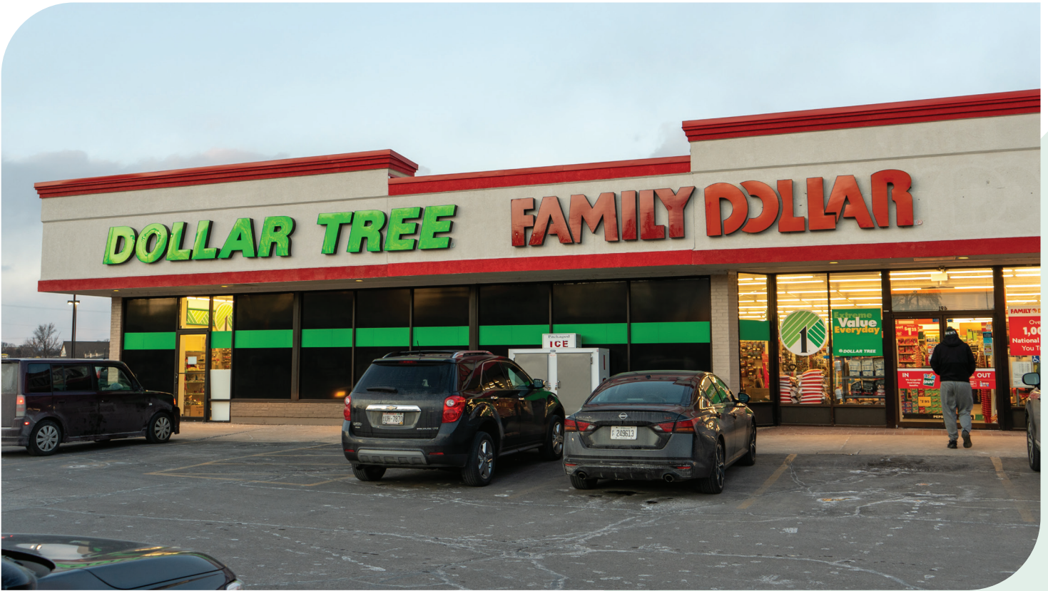
Dollar Tree - Burlington, WI.