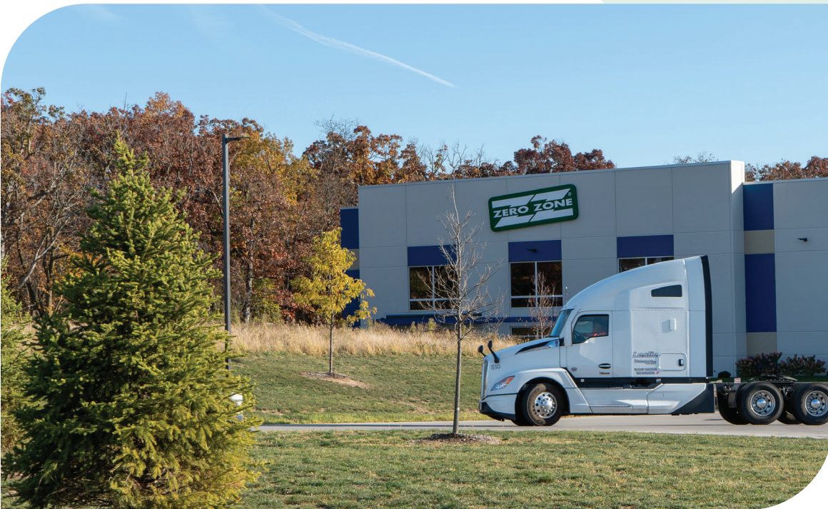
Zero Zone Distribution Center - Mukwonago, WI.