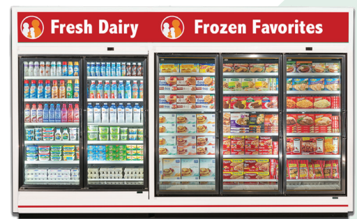
Highlight Merchandiser® Lineup

“No matter how quick we are at fixing problems, we always want to be faster. That goes to highlight, Zero Zone is the premier provider.”