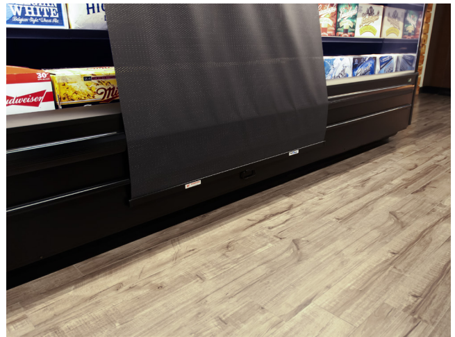
FIGURE 4: Night Curtain Pulled Down