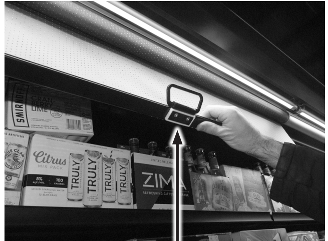
FIGURE 2: If Applicable, Orientate So Magnet Can Attach to Case