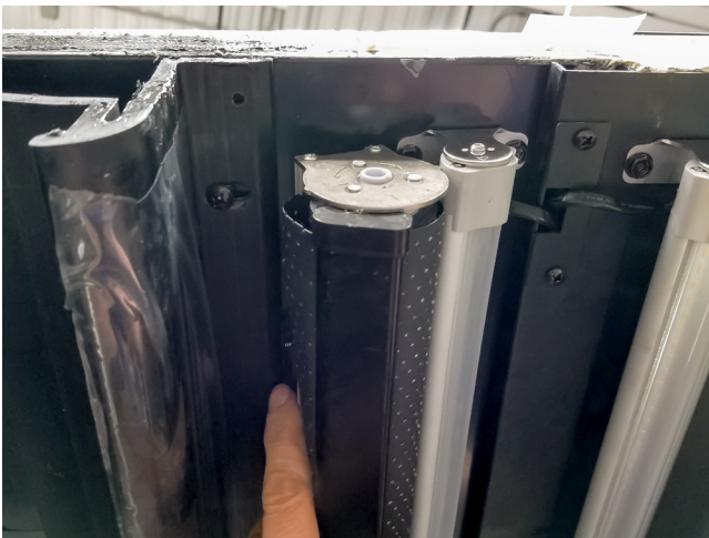
FIGURE 3: Tip Night Curtain Forward and Twist the Back into the Bracket